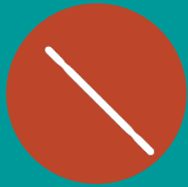
Wooden push stick