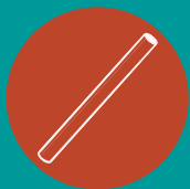
Pyrex glass pipe