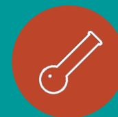
Heat resistant glass pipe